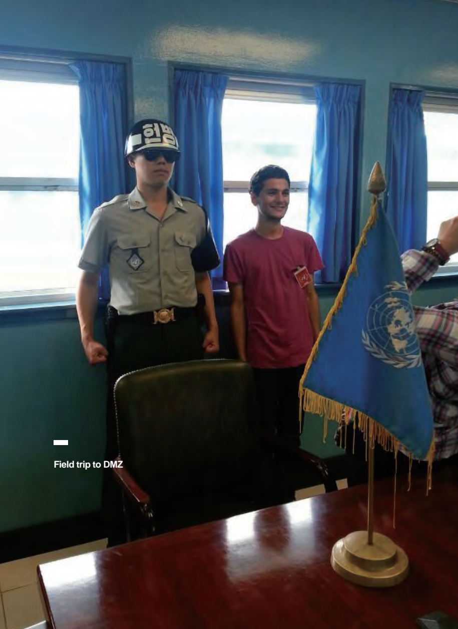
Field trip to DMZ